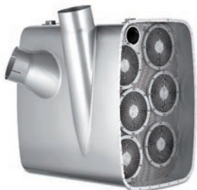
SMF® system for Commercial Vehicles

If de-minimis aid is not considered, the investment is worthwhile after about 58.000 km with a Euro II truck.