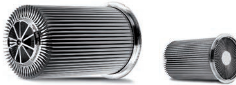
SMF® – the centrepiece of all HJS systems

The centrepiece of all HJS exhaust treatment systems is the sintered metal filter (SMF®). This closed filter for trucks reduces the emissions of soot particles, including ultra-fine particulate matter, by almost 100 percent.